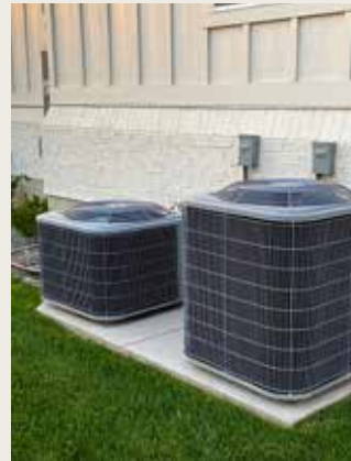
Seller HVAC Option