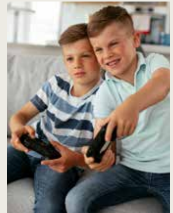
Electronics Protection Plan